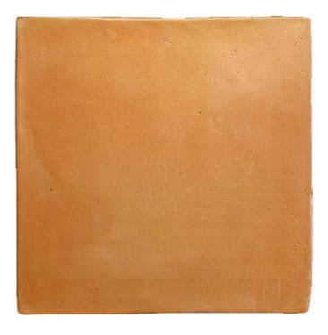
Image 3.1. Natural finish after applying the ACT03-AM matt treatment (oil-based).

Before the treatment, there is the possibility of requesting the application of the protection by WATERPROOF in the factory. This factory-applied protection facilitates grouting and keeps the tiles clean during the construction process.