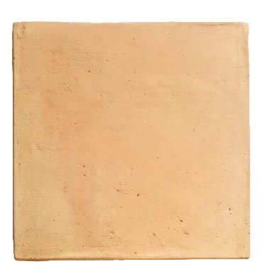
Image 3.2. Natural finish after applying the ACT02-AAM matt treatment (water-based)