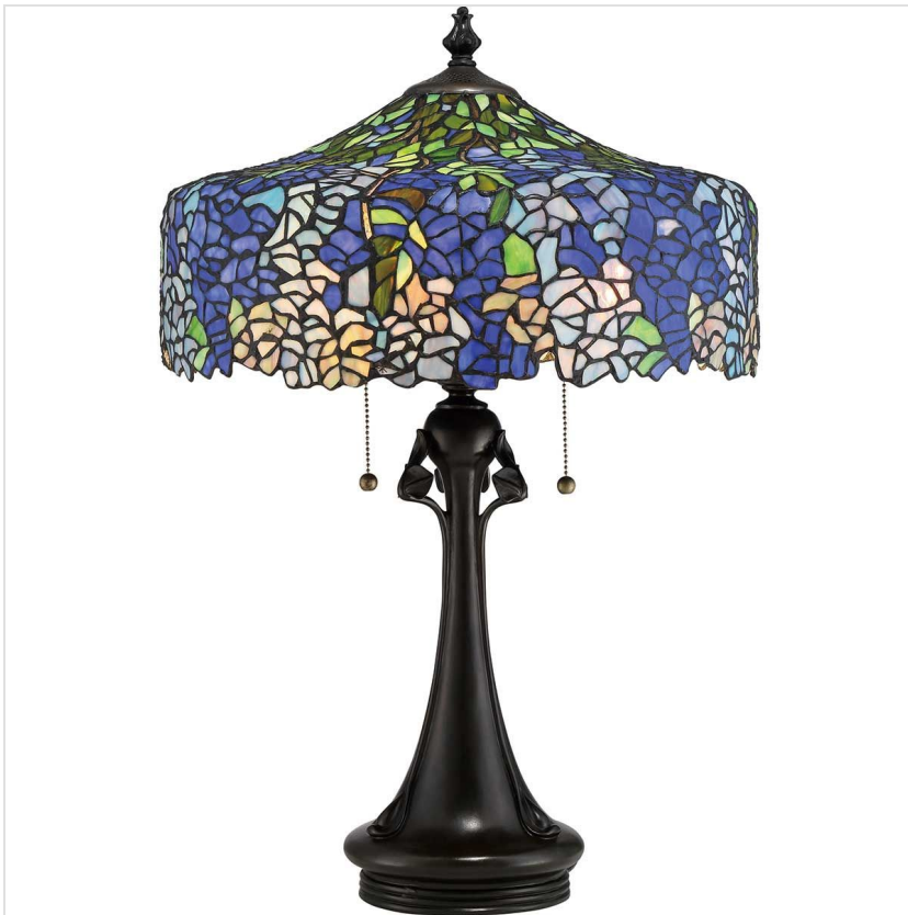
QZ-COBALT-TL Cobalt 3 Light Table Lamp - Vintage Bronze